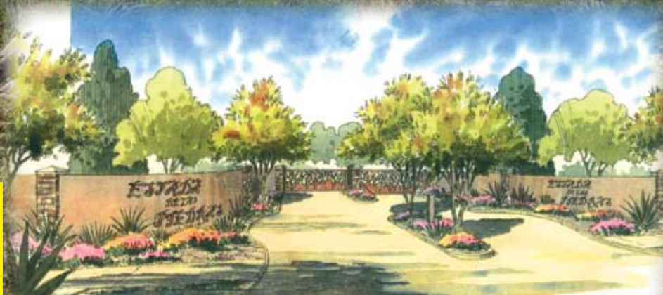
Illustration of entrance - subject to change.

North of Westland on Hayden Rd Next to Boulders Golf Course