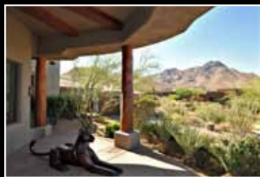
11310 E. Desert Vista Rd. Troon Ridge Estates • 4,248 Sq. Ft. Offered at $1,395,000