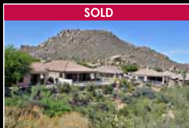
11526 E. Diamond Cholla Dr. Desert Views • 2,133 Sq. Ft. Sold for $430,000