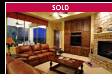
12126 E. Chama Rd. Sonoran Crest • 5,905 Sq. Ft. Sold for $1,225,000