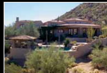
25916 N. 113th Way Windy Walk Estates • 4,475 Sq. Ft. Offered at $1,900,000