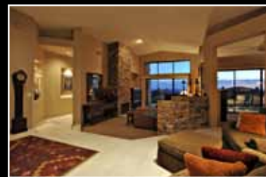
24350 N. Whispering Ridge Way #29 Whispering Ridge • 2,450 Sq. Ft. Offered at $649,000