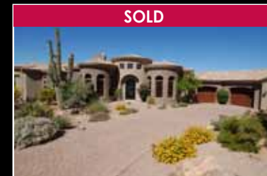
26246 N. 114th St. Boulder Pass • 3,738 Sq. Ft. Offered at $1,350,000

All information is deemed reliable but not guaranteed.