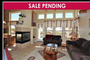
11539 E. Bronco Trail Saddleback • 2,090 Sq. Ft. Offered at $435,000