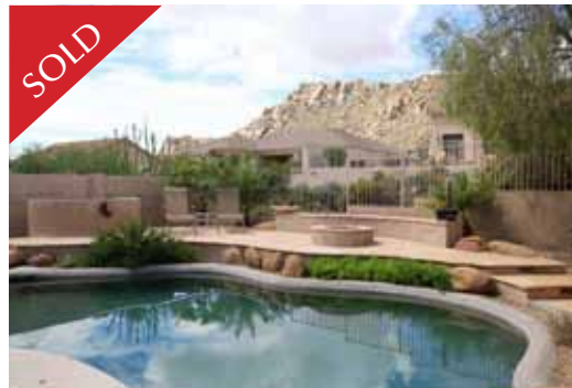
Four Peaks | Troon Village SOLD $500,000