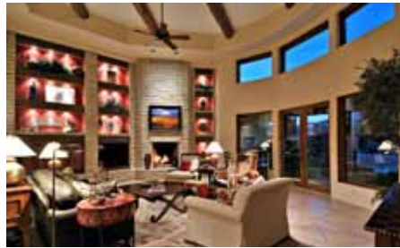
Glenn Moor | Troon Village 4 Bed + Den, 4 Bath | 4,305 SqFt | Offered at $1,525,000