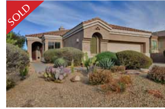
Desert Views | Troon Village SOLD $345,000