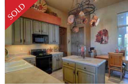
Four Peaks | Troon Village SOLD $455,000