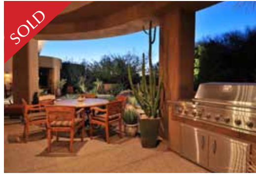
Troon Ridge 2 SOLD $865,000