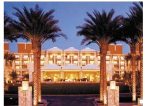
Desert Ridge Marriott

Desert Ridge Marriott Resort & Spa at 950 rooms is the largest hotel in Arizona. The $300 million resort, completed in 2002, is home to 36 holes of championship golf, 8 tennis courts, a 28,000 square-foot spa, 10 food-and-beverage outlets, a fitness center and swimming pools with "lazy river".